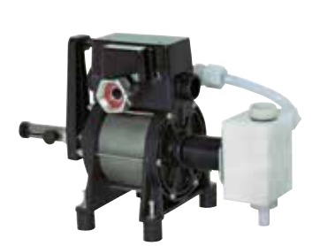
Concentration Controls Mixing and proportioning units to simplify coolant dispensing