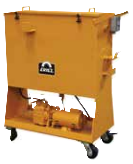
Portable Coalescer High volume removal of free oils and fine particulates