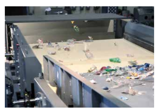
Eddy Current Separator sorts aluminum cans in a recycling facility.