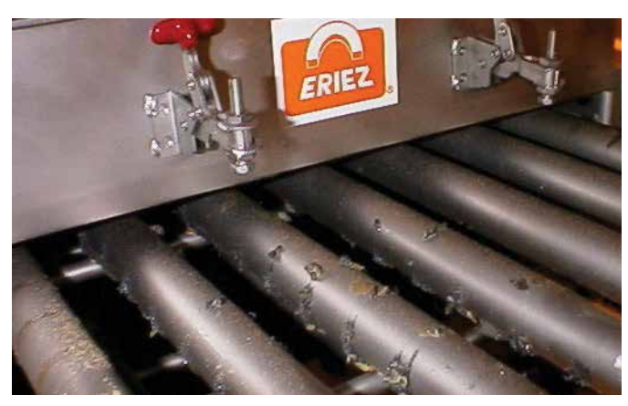
▲ Grain mill uses Xtreme Rare Earth grate magnets to remove metal contaminants.

▼ Suspended electromagnet removes tramp metal at an aggregate plant.