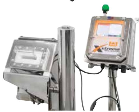
Pharmaceutical Metal Detector compact system for tablet press rooms that detects and removes submillimeter metal.