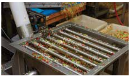
Grate Magnets used in food preparation at Better Baked Foods. Grate Magnets provide powerful, permanent protection against fine and tramp iron contamination.