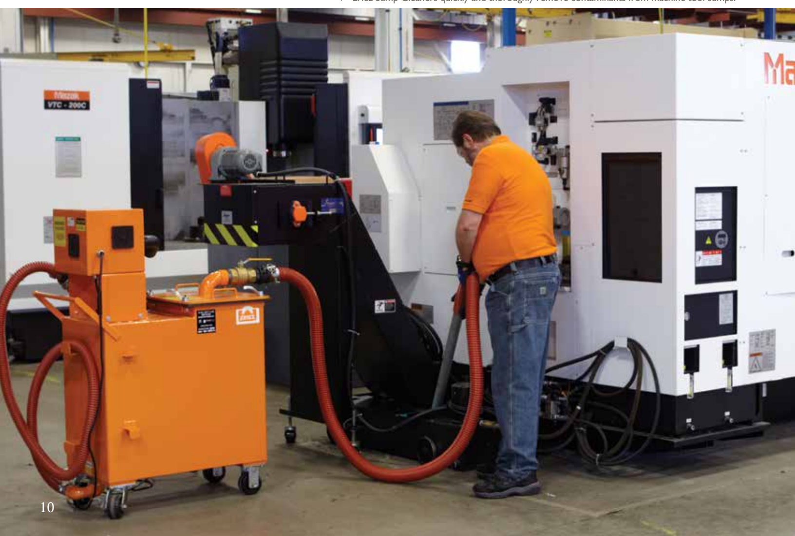
▼ Eriez Sump Cleaners quickly and thoroughly remove contaminants from machine tool sumps.

■ Eriez SumpDoc<sup>™</sup> removes metal chips as well as completely filters fluids, removing particles down to 5 microns.