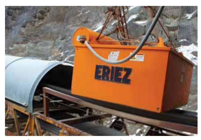
Many of Eriez products use magnetic technology.