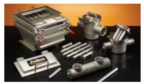
Small Magnetic Separators effectively remove tramp iron in both liquid and dry processing applications.

Magnetic equipment is commonly used to remove dangerous unwanted metal contaminants from product flows. This equipment is also widely used in resource recovery applications to sort and reclaim valuable metals.