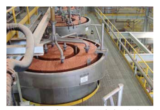
Eriez' 2007 purchase of Canadian Process Technologies (CPT) established Eriez Flotation as a market leader for both fine and coarse flotation.