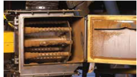
Magnetic Rota-Grate® removes metal contaminants from dry process flows. The slowly rotating tube circuit catches unwanted tramp iron and prevents bridging of powdery material like flour.