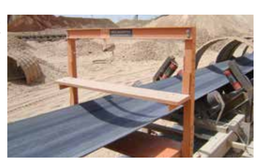
1200 Series Metal Detector detects large tramp metal for the aggregate and mining industries.