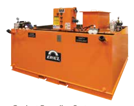
Coolant Recycling Systems Self-contained coolant and fluid management systems capable of recycling any water-miscible fluid to its maximum potential

Two-phase cleaning operation to remove chips, oils, and fines, then replenish sump with clean fluid