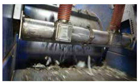
CleanStream Process recovers 99% of the ferrous and concentrates it to less than .2% copper in auto shredding facilities.