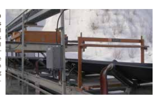
Double Team Tramp Metals combine powerful magnetic separators with sensitive metal detectors for the ultimate in protection from damaging tramp metals.