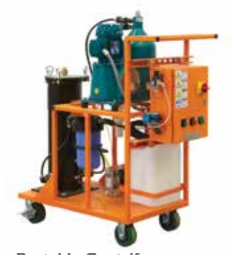
Portable Centrifuge Removes free and emulsified tramp oils through a high speed centrifuge