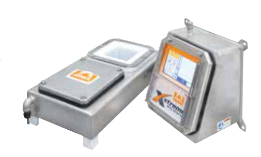
Xtreme Vertical Detectors ideal for detection and removal of ferrous, nonferrous and stainless steel metals in gravity-fed dry products such as plastic flake, grains, nuts, powders, etc.