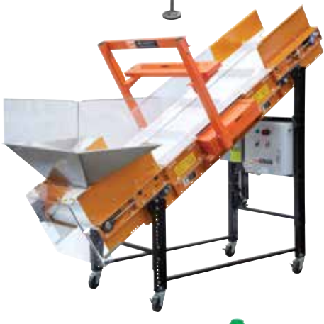
Metal Detector Conveyor convenient detector conveyor unit rolls into position to protect shredders, grinders and granulators.