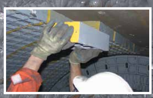
A magnet holds the liner to the drum.