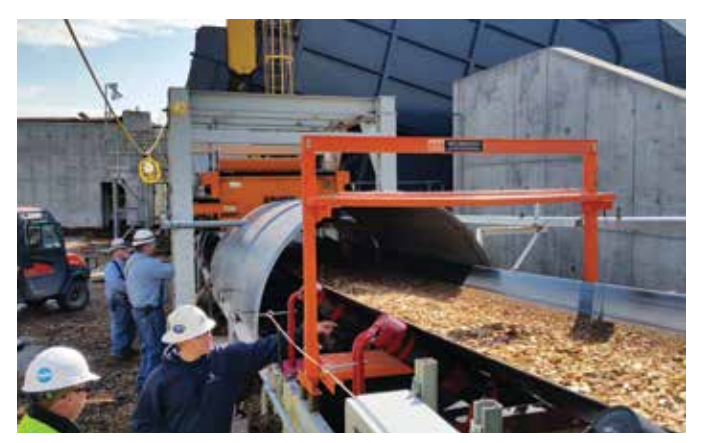
▲ A 1200 Series metal detector and a suspended magnet protect downstream equipment from tramp metals.

Eriez industrial metal detectors have applications in industries including food, packaging, minerals processing, aggregates, coal, ceramic, chemical, glass, pharmaceutical, plastics and rubber. Eriez offers metal detectors suited for the specifics of your application to detect and remove ferrous and nonferrous contamination.