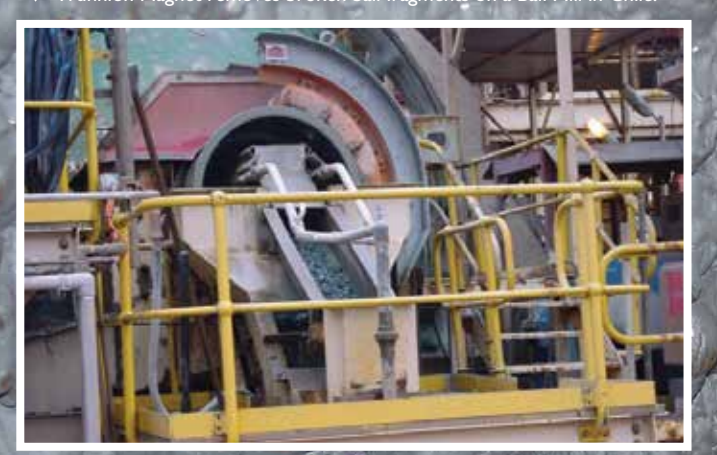
■ Ball chips are attracted to the liner and form a protective layer.