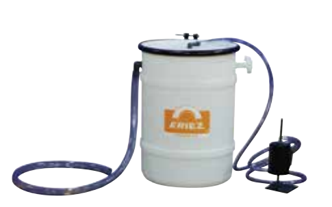
Tank Side Coalescer Allows tramp oils to naturally separate outside of turbulent sumps