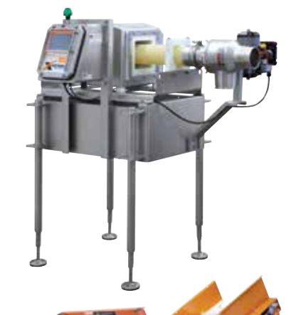
Xtreme Liquid Line Metal Detector for liquid slurries and pastes.