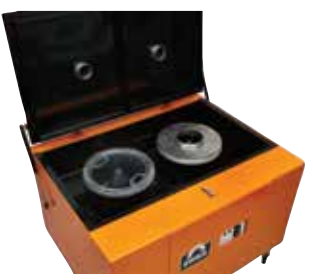
Rotor Bowl Centrifuge Rotor bowl centrifuge removes sludge in grinding, honing and finishing operations