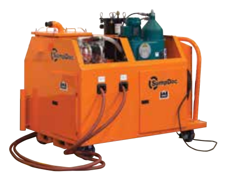
SumpDoc™ Inline Recycling and Filtration

Two-phase cleaning operation to remove chips, oils, and fines, then replenish sump with clean fluid