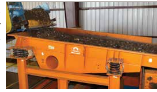
Mechanical Feeders present an even flow of material to an automated sorter at a scrap yard.