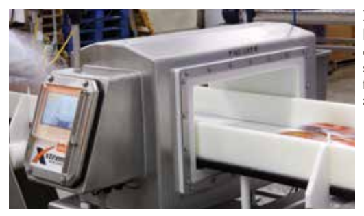
Xtreme Metal Detector our highest sensitivity system for food, pharmaceutical and rubber industry.

Eriez metal detectors are used in a variety of processing applications. Whether you're scanning for small ferrous, nonferrous or stainless steel contaminants or large tramp metal like digger teeth, Eriez offers the right metal detection solution.