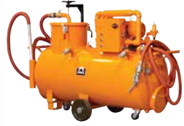
Sump Cleaner Vacuums chips from the sump and filters coolant for fast and easy sump cleaning